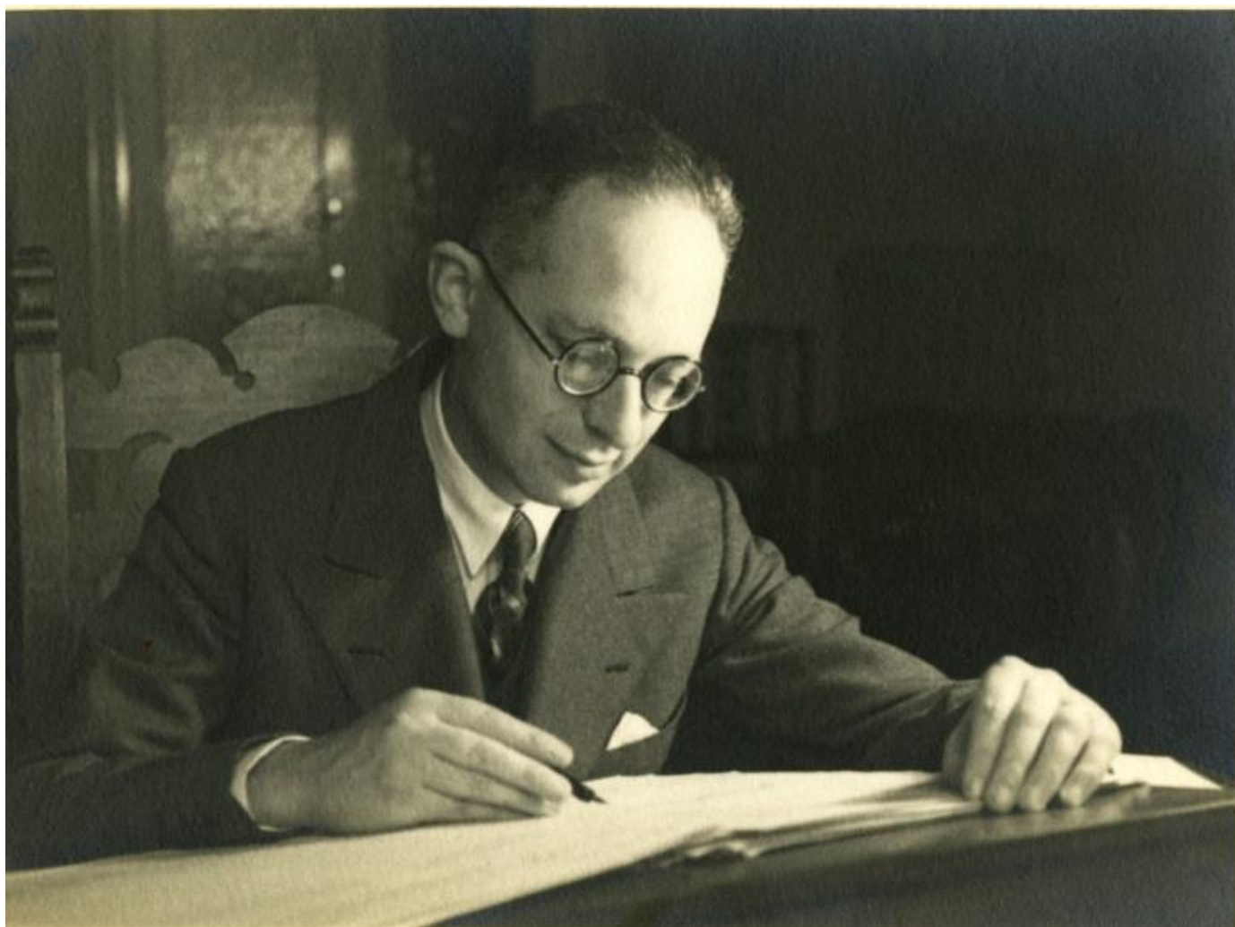
Mario Castelnuovo-Tedesco (1895-1968) at his desk, working on a score; Florence, early 1930s.