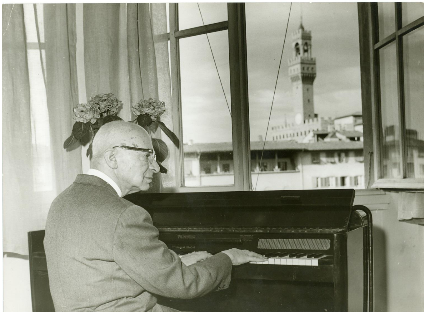
Mario Castelnuovo-Tedesco visiting his native city of Florence; ca. mid-1960s. Mario Castelnuovo-Tedesco Papers, The Library of Congress Music Division, Washington, DC; Box 144, Folder 15; reproduced by permission.

We are thankful for this opportunity to welcome Mario Castelnuovo-Tedesco back to his city he was once forced to leave, and to introduce these remarkable manuscripts of his settings of English and American poetry in this very place, within an international context.