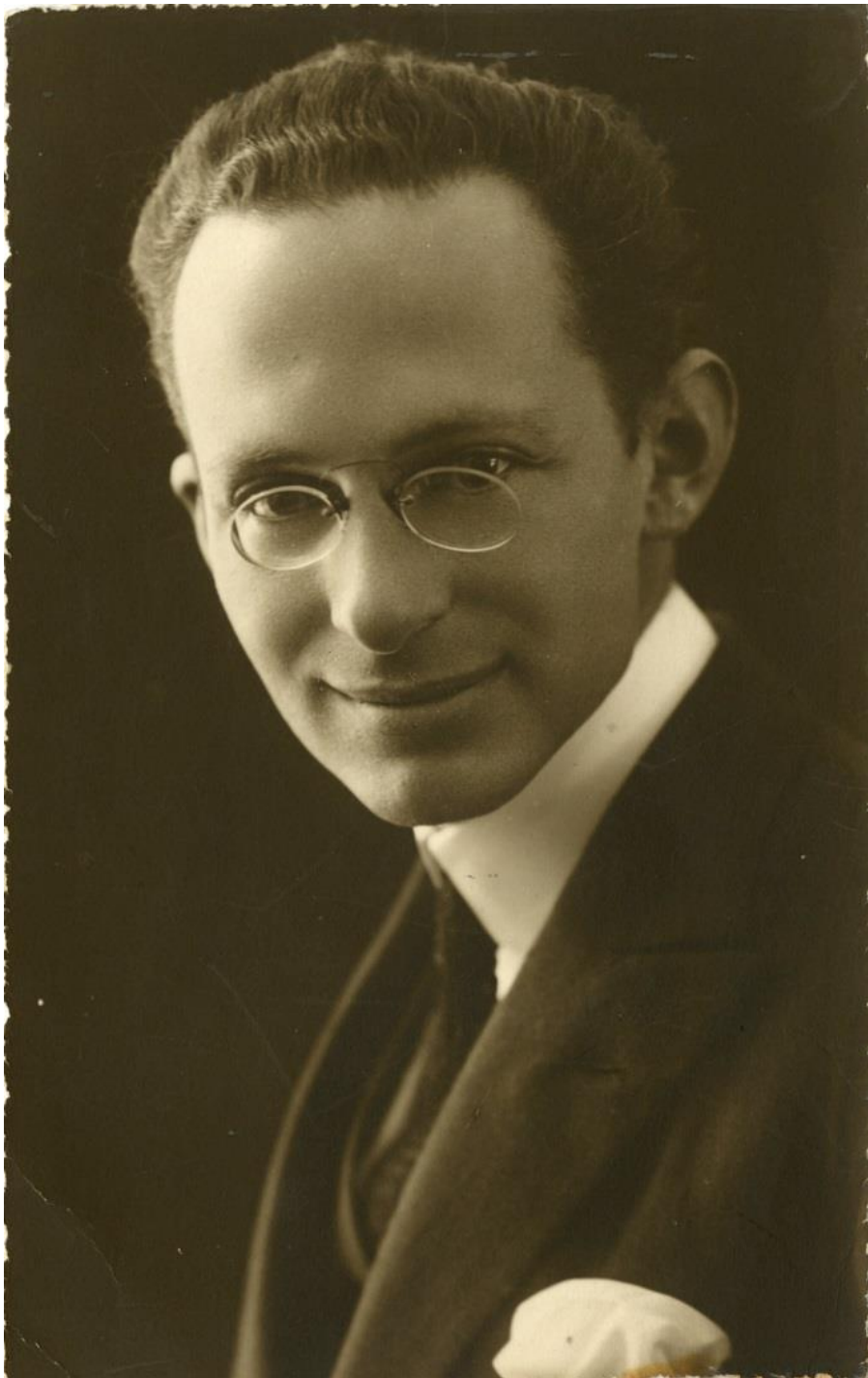
Mario Castelnuovo-Tedesco, Photographic studio portrait

This session focuses on a prominent figure of the 20 th century. Italian Jewish composer Mario Castelnuovo-Tedesco was born in Florence in 1895 and lived in his beloved city until—after the promulgation of the Racial Laws—he was forced to expatriate with his family to the United States, shortly before the outbreak of World War II. In America he would live for the rest of his life, and only occasionally would he return to Florence.