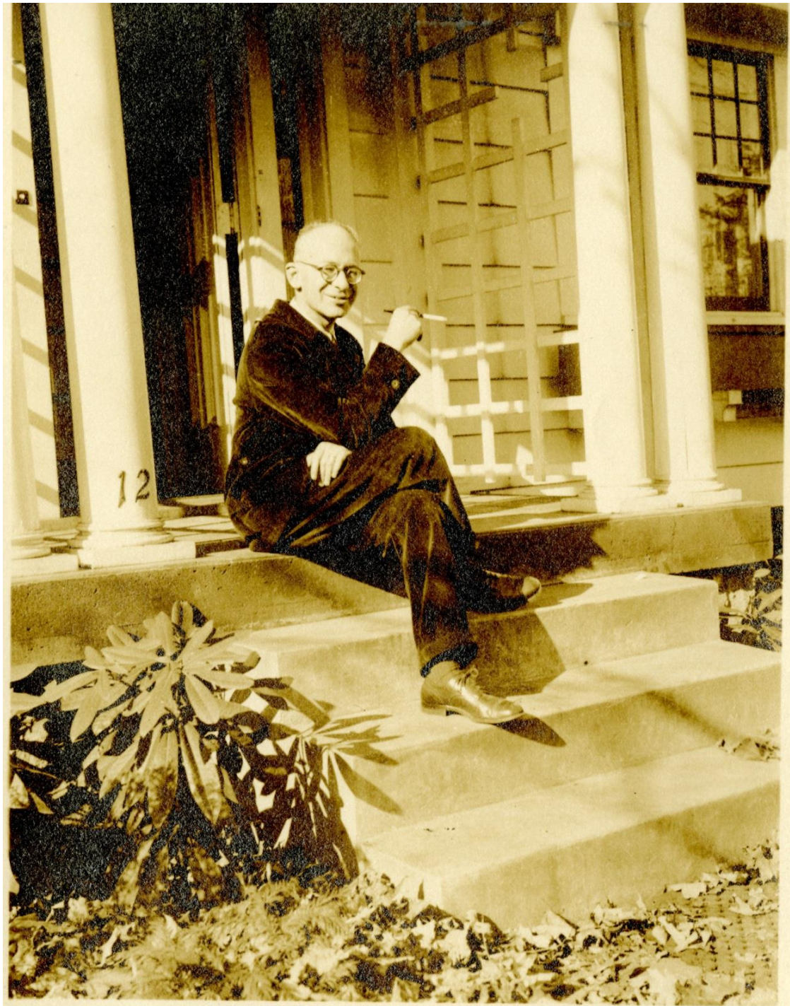
Mario Castelnuovo-Tedesco beginning life in America, outside his new house in Larchmont, N.Y.; autumn 1939.

In the US from 1939, Castelnuovo-Tedesco also set to music contemporary American poems, by Edna St. Vincent Millay (1892-1950) and Arthur Guiterman (1871-1943), both well known in their time. By St. Vincent Millay, he set Recuerdo and Tavern (unpublished manuscript). By Guiterman, he set The Legend of Jonas Bronck and New York .