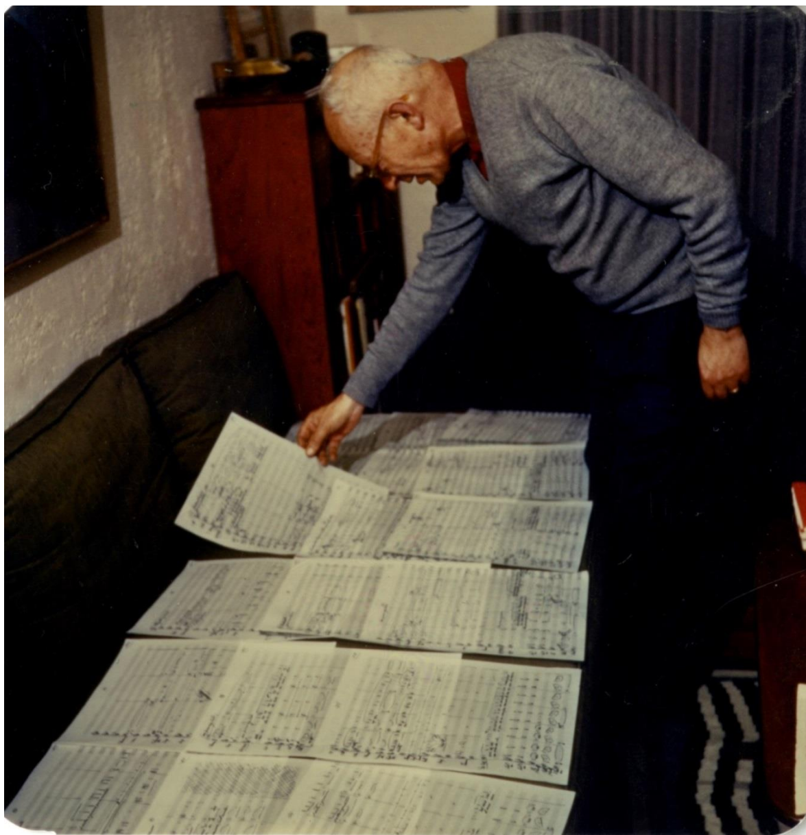
Mario Castelnuovo-Tedesco in his studio; Beverly Hills, 1960s.

After the enforcement of the Racial Laws, with the help of Heifetz, Toscanini, and of violinist Albert Spalding, Castelnuovo-Tedesco and his family left Italy in the summer of 1939. They eventually settled in Beverly Hills, California, where he started a new career as composer for film scores at the MGM Studios in Hollywood. An American citizen since 1946, he died in Beverly Hills in 1968. A life—and a career—divided in exactly two parts.